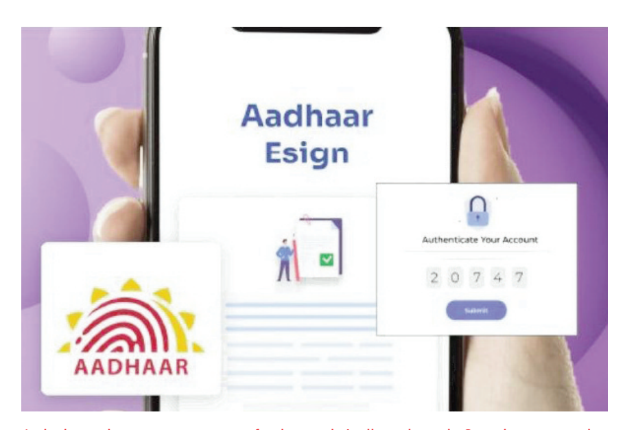
India has taken e-signing a step further with Aadhaar-based eSign, leveraging the Aadhaar identification platform for Aadhaar holders. If you possess an Aadhaar card and linked mobile number, you can digitally sign documents with ease.

India has taken e-signing a step further with Aadhaar-based eSign, leveraging the Aadhaar identification platform for Aadhaar holders. If you possess an Aadhaar card and linked mobile number, you can digitally sign documents with ease. The eSign service verifies your identity through Aadhaar eKYC, ensuring a secure and reliable experience. The document to be e-signed first needs to be converted into digital formats like PDF, and the signer is then presented with various signing methods based on the security level. Simple signatures might involve typing names or uploading images, while advanced